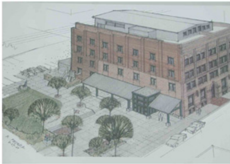
Sketch of the finished downtown project