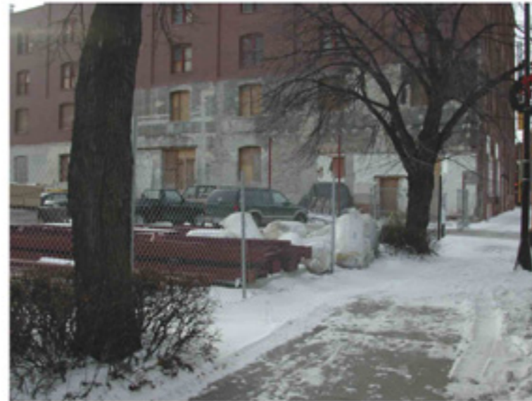
Site is inbetween trees