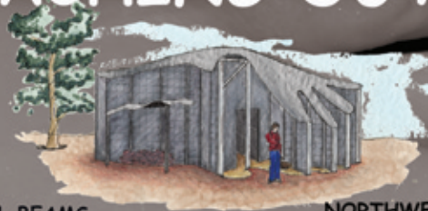
NORTHWEST PERSPECTIVE 1/4" = 1'