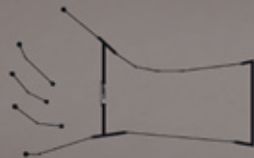
PLAN 1/4" = 1'